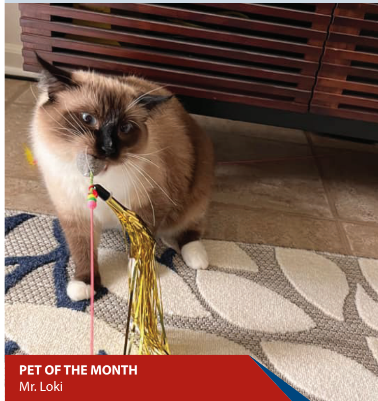
PET OF THE MONTH Mr. Loki